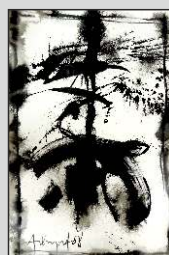
20" X 30"

Medium - Ink, Acrylic, Oil, Pastel, Pencil (Mix Media)