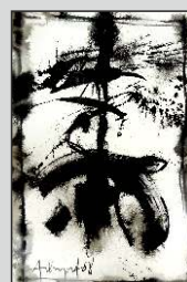
20" X 30"

Medium - Ink, Acrylic, Oil, Pastel, Pencil (Mix Media)